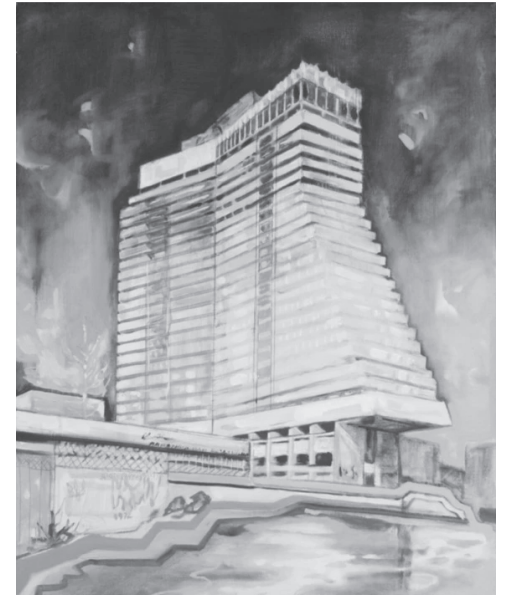
Nadiya Svirsky Hotel Parus (Past, Present...) , 2019 Oil on canvas