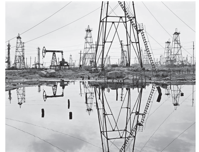
Edward Burtynsky SOCAR Oil Fields #3, 2006