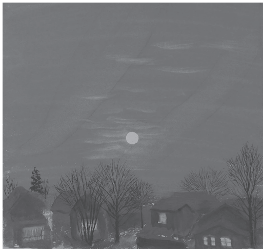
Robert Achtemichuk March 6, 2013 8:55 pm , 2013 Gouache on paper