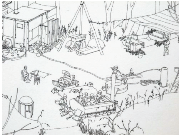
Olya Mishchenko Untitled (Don Blanche) detail 2011 pen and ink on paper